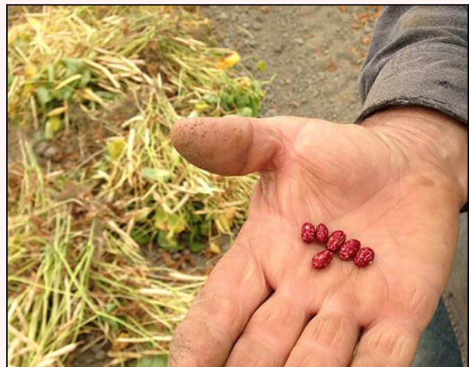
Dry-farmed dry beans at Warren Creek Farm in Northern California in August 2015.