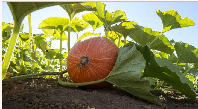
Dry-farmed winter squash at the Oregon State University Vegetable Research Farm.

Although perennial weeds such as bindweed and Canada thistle may persist in a dry-farmed system, many dry farmers report that without irrigation they have fewer annual weeds to manage. In a field with little to no perennial weed pressure, much of the work would happen in the spring — preparing the soil, planting and managing annual weeds until rains stop. Typically, in late June to late July, there is a window of minimal crop management until harvest begins, which could result in some downtime for the farmer.