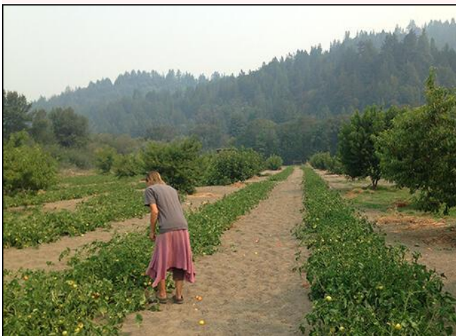
Dry-farmed tomatoes at New Moon Organics in Shively, California, in August 2015.