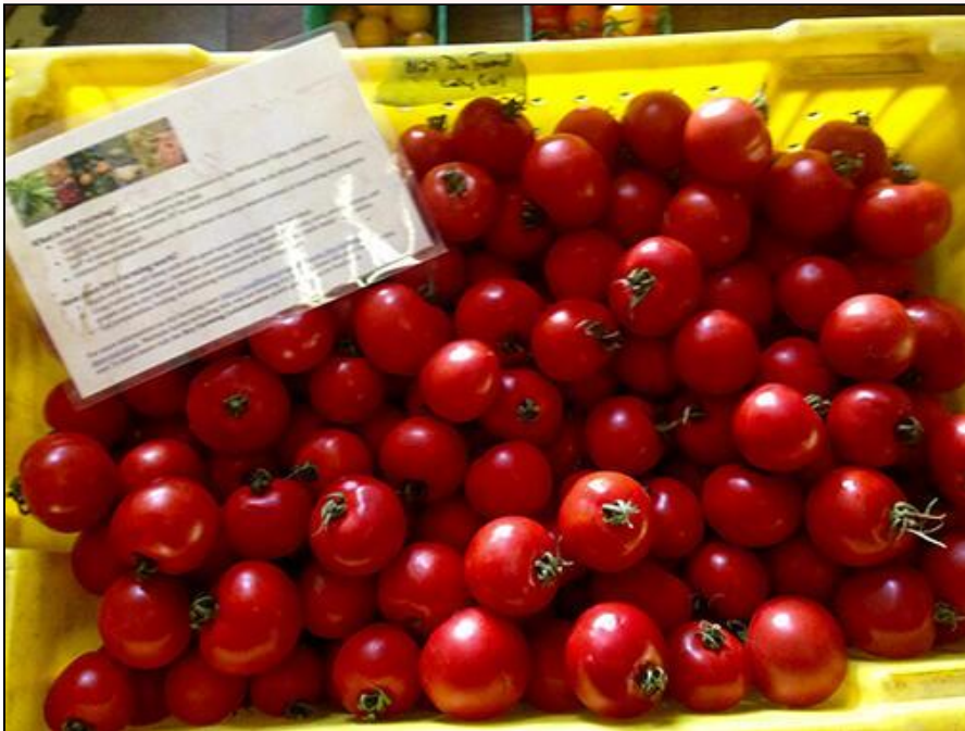
Dry-farmed Early Girl tomatoes harvested at Gathering Together Farm on August 24, 2016.

As customer awareness and interest in dry-farmed produce increases, niche-marketing opportunities arise. Some farms with plenty of access to irrigation have expanded their production of dry-farmed tomatoes, for example, because of customer demand and interest in flavor as well as values held about natural resource conservation.